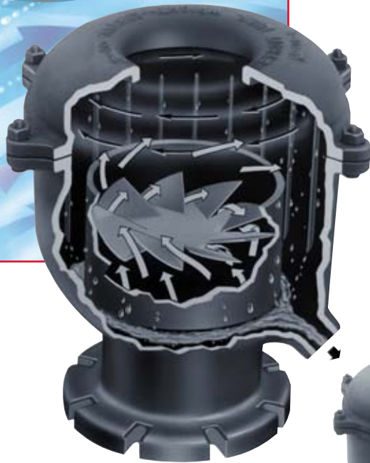
Type 40EHC (cast)