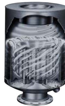
Type 40EHMF (fabricated)