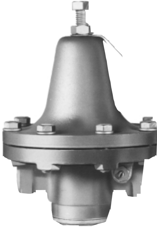
TYPE D50 DIRECT ACTING PRESSURE REDUCING VALVE