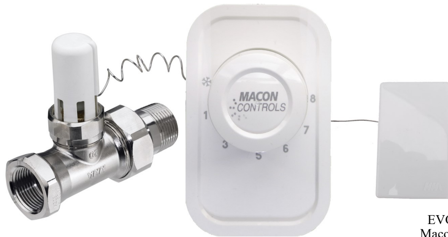
EVOLZ shown with Macon NT series valve (sold separately)