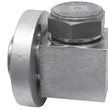
UTD450 & UTD600 Thermodynamic Steam Trap Module (Side Mount Style) For vertical or horizontal piping installations.

Steam trap modules can be used with other manufacturers' Universal Connectors.