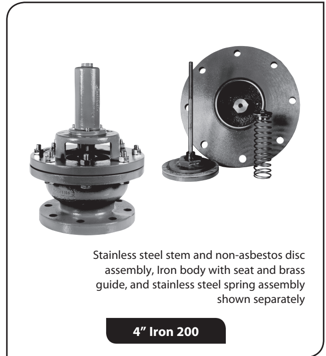
Stainless steel stem and non-asbestos disc assembly, Iron body with seat and brass guide, and stainless steel spring assembly shown separately

The Type 200 cannot be set to open at a particular vacuum. The vacuum values presented in the table are for reference only.